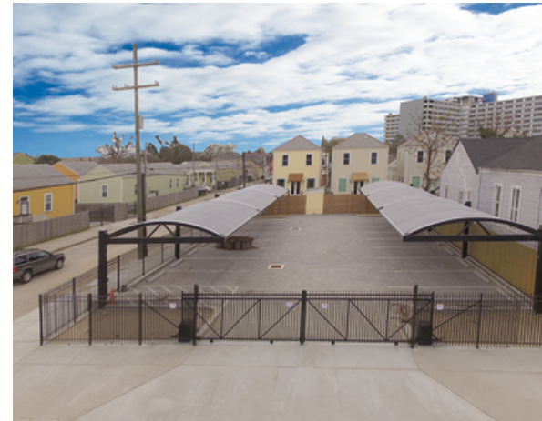
Thalia Parking Cost $183,600 New parking space, 2,000SF.