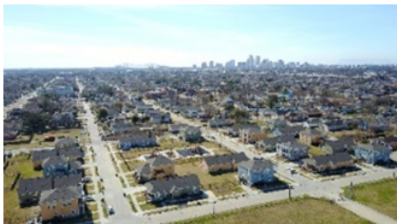
HANO, Florida and Guste Developments Cost $8,288,132 Correction and completion of 156 residential units.