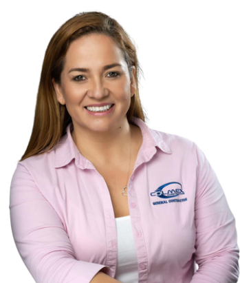
Angelica Rivera President