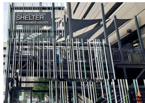
City of NOLA Low Barrier Shelter 40,000SF Renovation Cost $4,180,750 Interior built out to increase the current shelter's capacity by 200%.