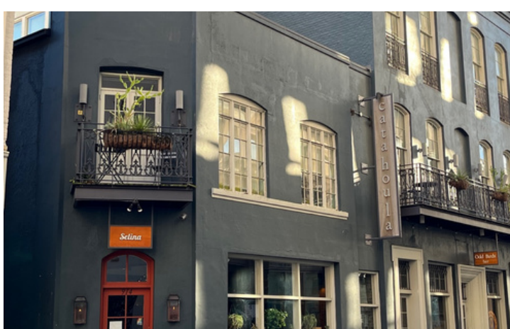
Catahoula Hotel Cost $502,918 Partial renovation of 15,000SF hotel.