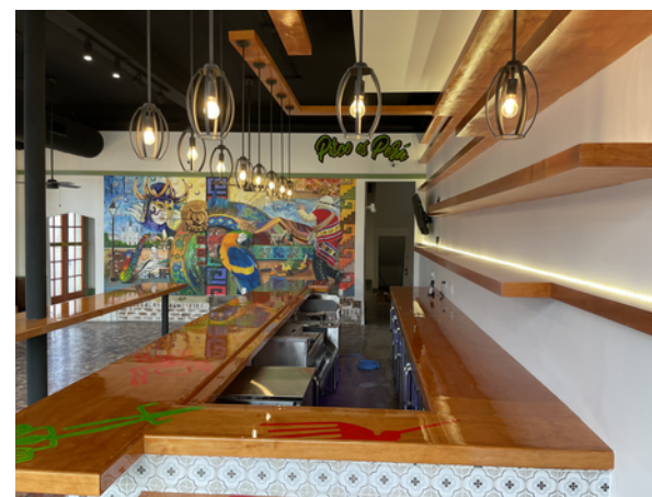
Tito's Ceviche Cost $718,812 Restaurant total renovation of 4,582 SF.