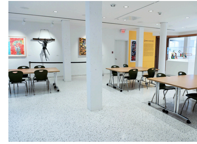
Helis Foundation Cost $1,222,302 Renovation of existing structure for gallery space. Approx 5.800SF