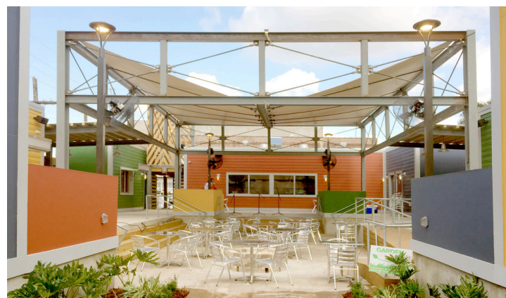
Good Work Network Culinary Incubator 3,000+- SF New Construction Cost $720,000 Construction of a new facility to house a culinary incubator.